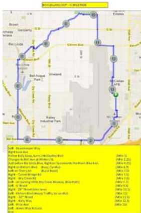
McClellan Bike Ride 13 miles