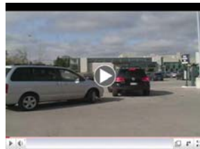
Going Green - Carpooling

Does this video remind you of someone you work with? It does me.